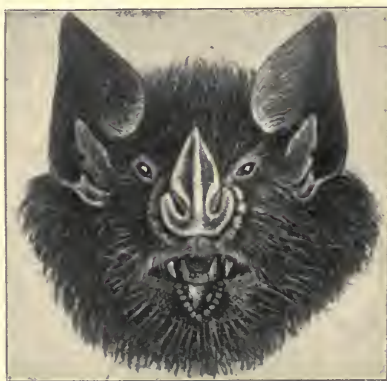
FIG. LXX. PHYLLOSTOMA HASTATUM. SPEAR-NOSED BAT.